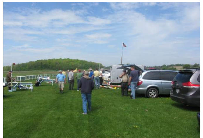
There was a fairly respectable turnout for the first annual Lakeland R/C Swap Meet