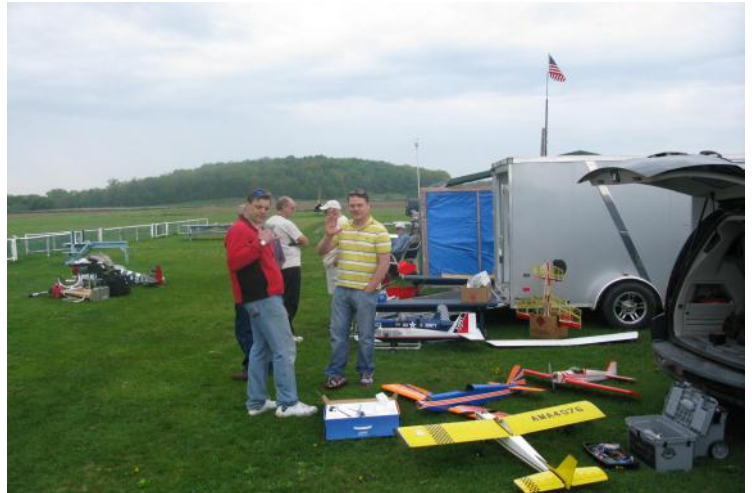
A couple more shots from the swap meet